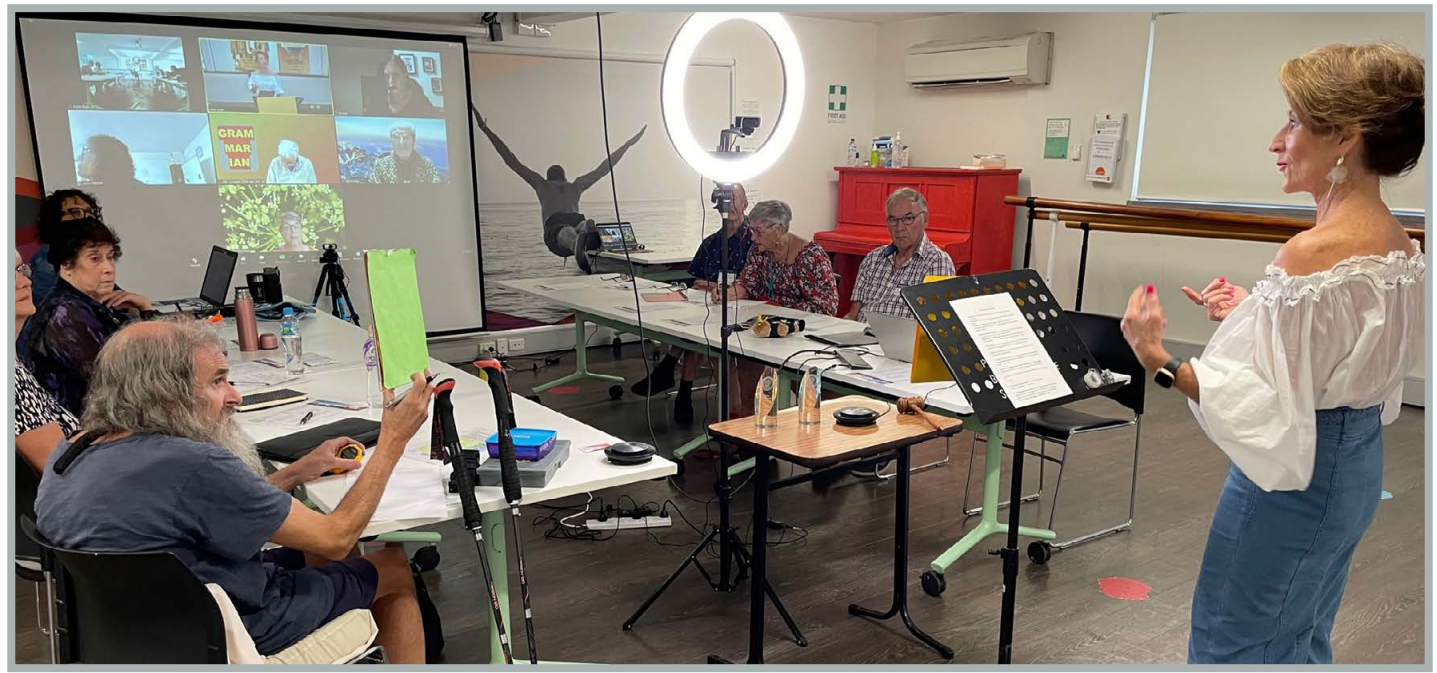
BRISBANE SUNRISE SPEAKERS in Brisbane, Queensland, Australia, host a "Room and Zoom" hybrid meeting after a recent rebranding. To help attract new members, the club expanded its online social media presence, updated its website, and welcomed guests and members from the United Kingdom, United States, Canada, India, and Mongolia. The club also conducted an intensive twoday Speechcraft course over 800 miles from Bisbane for staff and volunteers of the Queensland Rural Fire and Emergency Services.